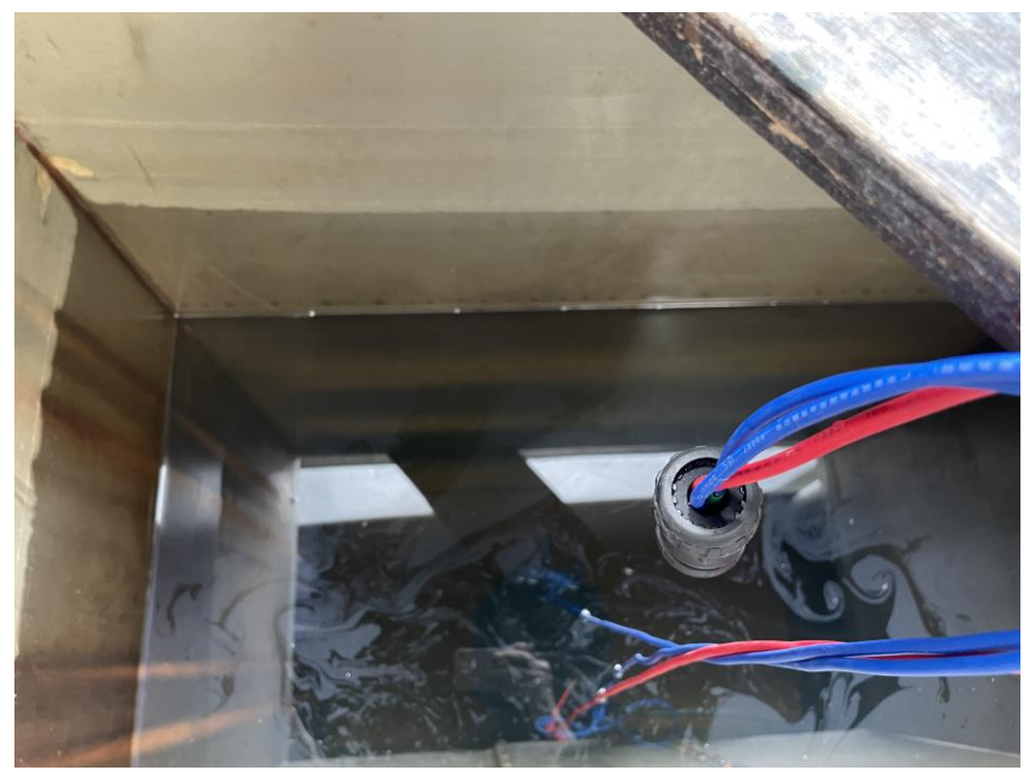
Test setup of IPX6