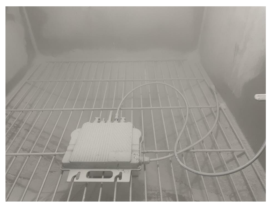
Test setup of IP6X