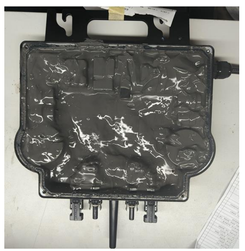
Checked after test finish