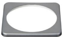
BMV bezel square

We recommend our Battery Balancer (BMS012201000) to maximize service life of series-connected batteries.